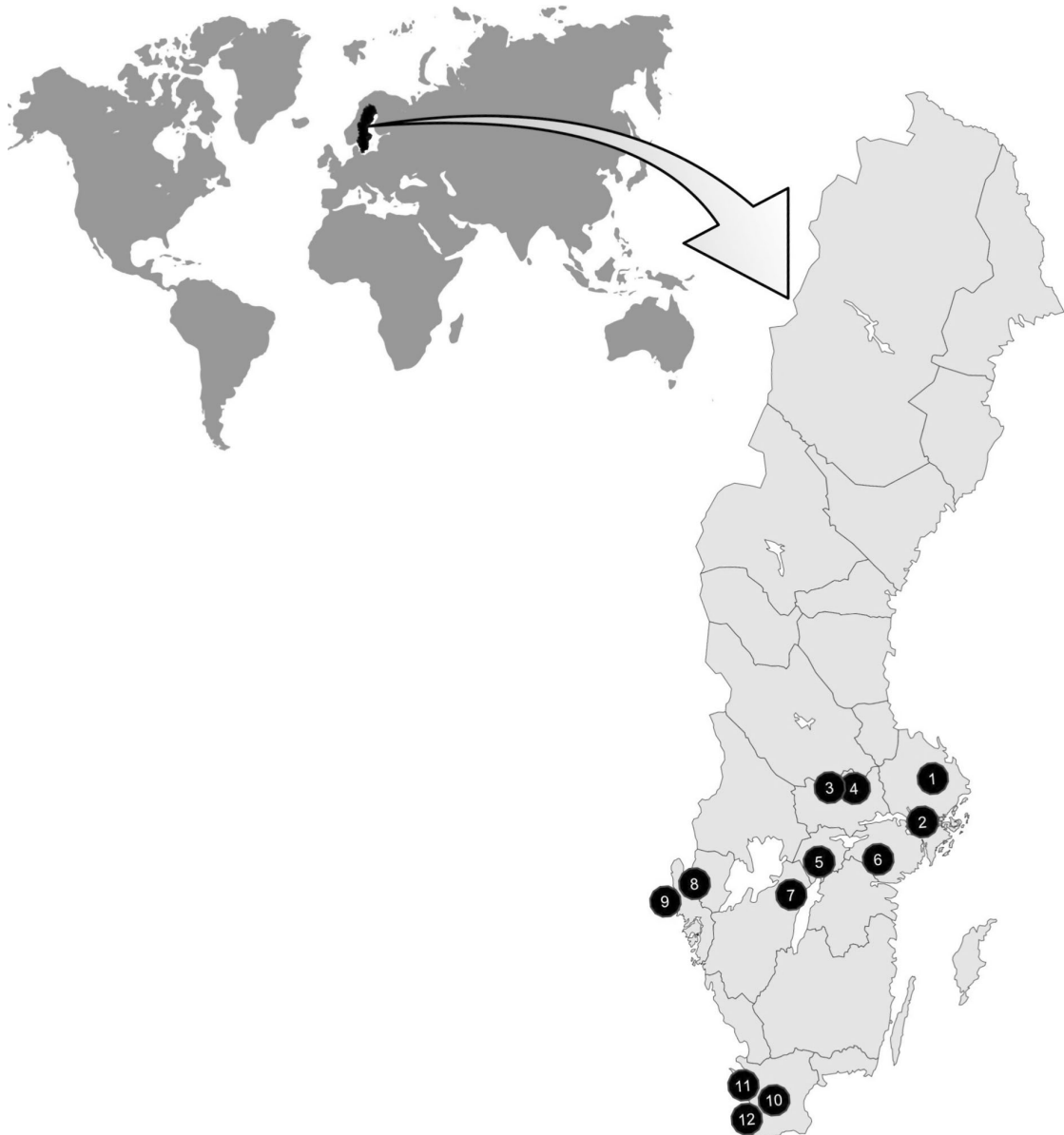
Fig. 1 Map of Sweden showing geographical positions of the edible forest gardens in the study

shade in hot and sunny climates, might not be useful when sunlight is a critical factor in intercropping systems. Especially in locations as Sweden, where the majority of the landscape is used to produce timber. It might be better for the tree layer to be lower, including smaller or coppiced trees that provide edible fruits, berries, leaves and possible nitrogen