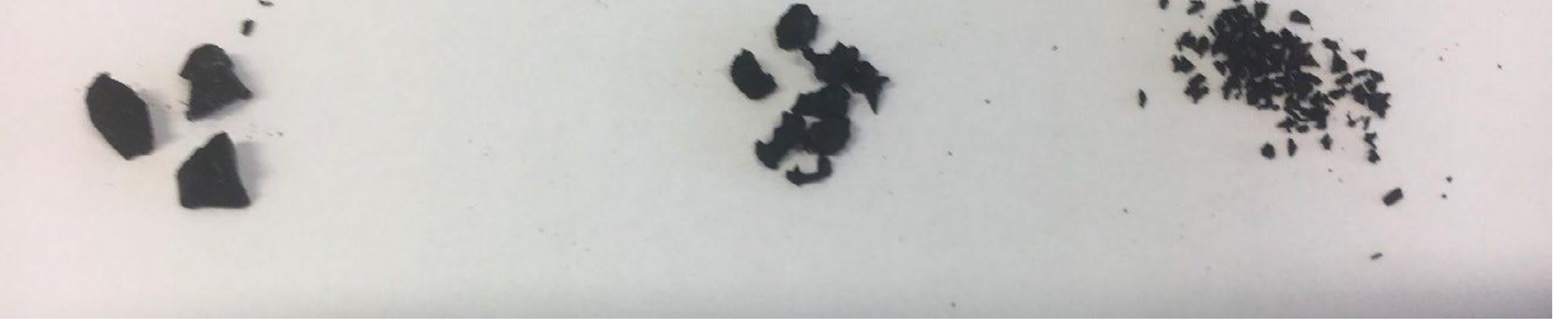
Figure I. Three different particle sizes tested in this study (from left to right): granular, medium, and fine